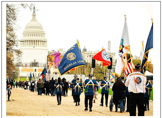
On 11/11/2022, Iroquois Post 1587 participated in the National Native American Veterans Memorial dedication in Washington, DC.