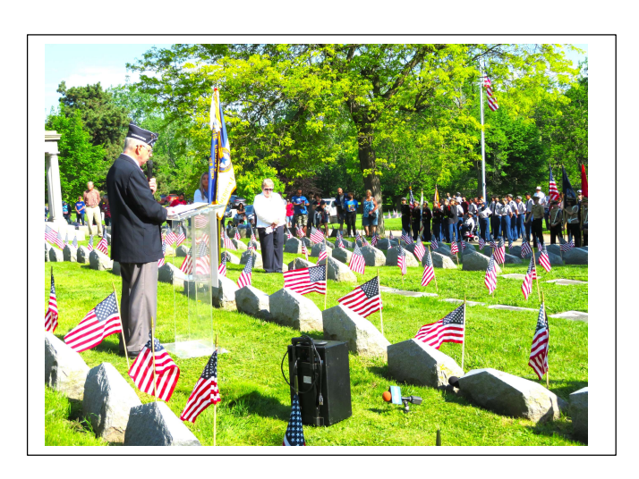
Erie County Commander giving his address at the 2022 Memorial Day Service at Forest Lawn Cemetery.