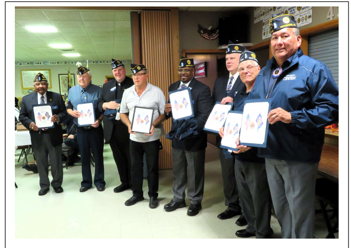
2023 Post Membership Leaders received Citations and American Legion Jackets at the September Erie County Meeting at Concord Post #431.